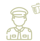
24x7 Security & Central CCTV