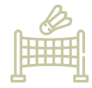
Shuttle Badminton Court